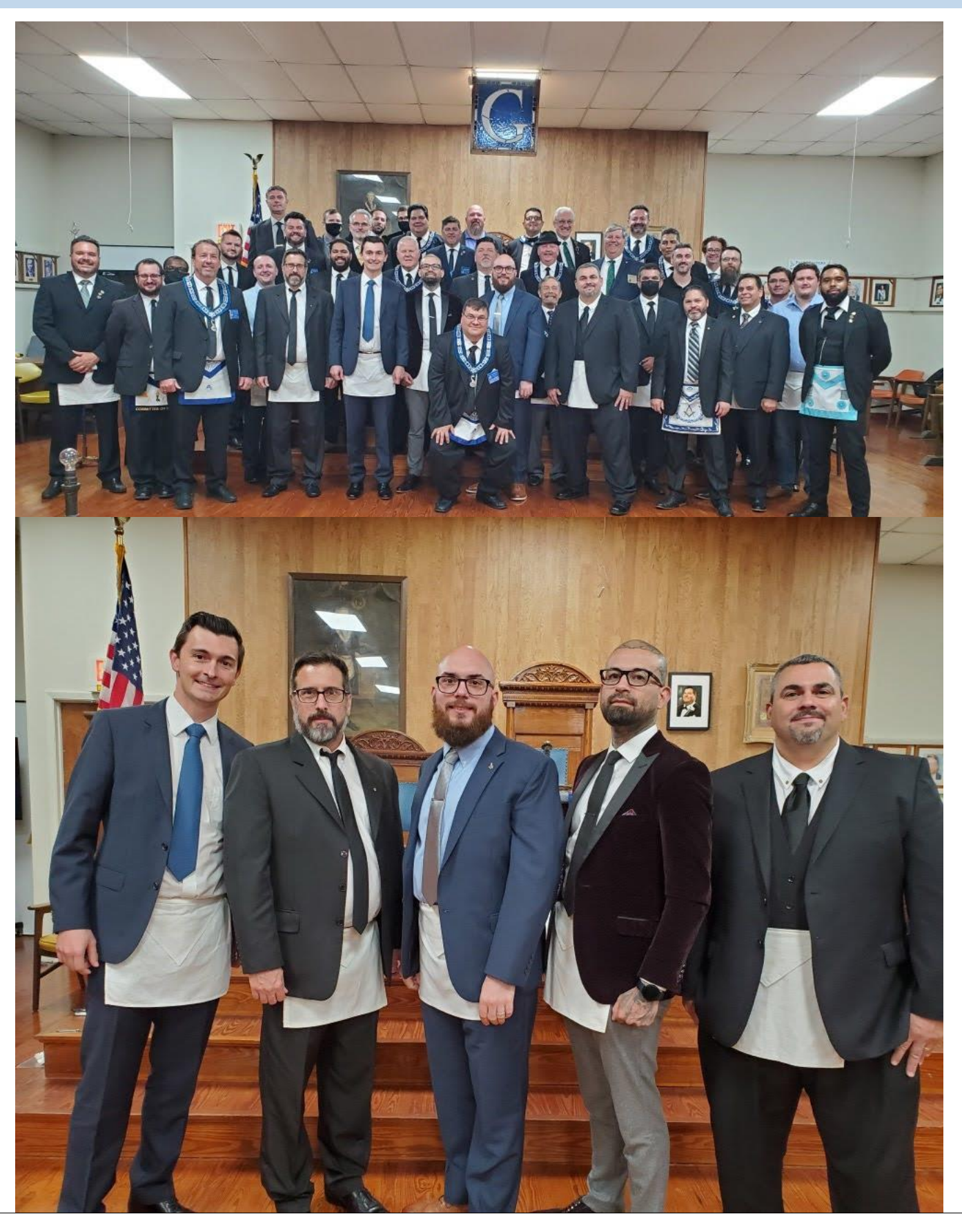
Welcome our newest Master Masons!