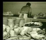
What I really do