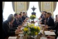
What my mom thinks I do