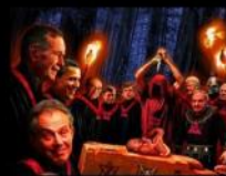
What conspiracy nuts think I do